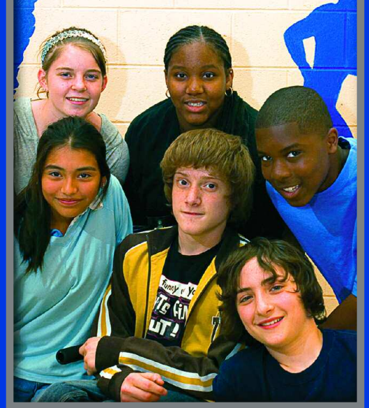
7th & 8th graders in the Cafeteria at F. Niel Postlethwait Middle School

For a spanish version of this brochure, please go to www.udel.edu/compromiso