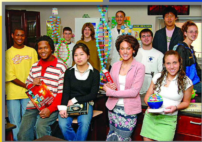
Biology & Physical Science Students at Caesar Rodney High School

It is as close to a “guarantee” as we can make it. While no university can guarantee admission until a student has submitted a complete application, we can lay out what you need to do in grades 9 through 12 if you want to give yourself the best chance of being admitted. Our intention is to help students, parents, teachers, and guidance counselors answer the question, “How can students best prepare themselves for admission into the University of Delaware?”